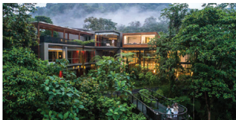
Rainforest Mashpi Rainforest Reserve

Set in an elegant mansion in the heart of Quito, this is the best luxury hotel in the capital, a member of Relais @ Châteaux . Hailed by Condé Nast Traveler and Travel + Leisure , our intimate hotel offers 31 lavish guestrooms.