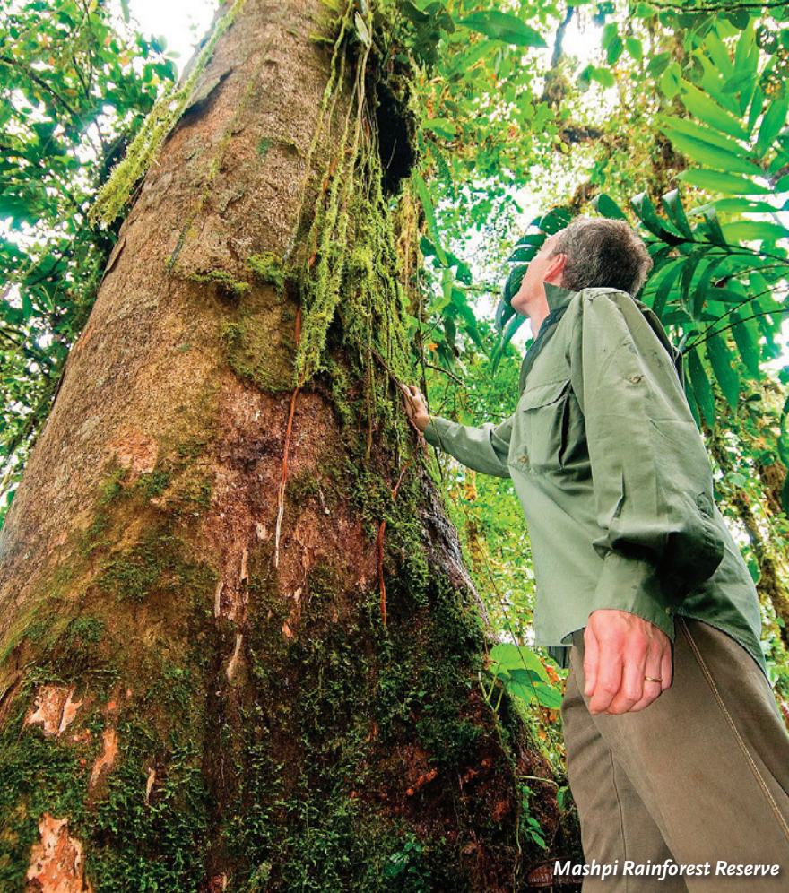
Mashpi Rainforest Reserve