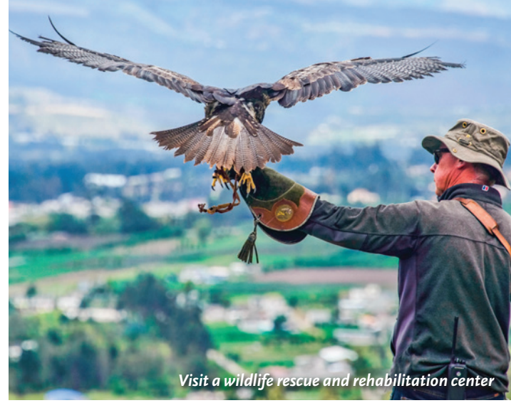
Visit a wildlife rescue and rehabilitation center