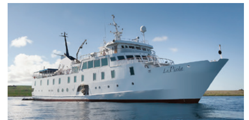
Galapagos Islands La Pinta

Mashpi is a five-star lodge in the forest, cited as one of the world's best hotels by Condé Nast Traveler and its 2025 Gold List. It was conceived and is meant to be a unique travel experience where the material features of the property complement one of the most remarkably biodiverse corners of the world, now protected as a Nature Reserve.