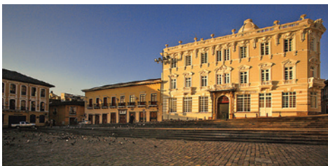
Quito Casa Gangotena

Set in an elegant mansion in the heart of Quito, this is the best luxury hotel in the capital, a member of Relais @ Châteaux . Hailed by Condé Nast Traveler and Travel + Leisure , our intimate hotel offers 31 lavish guestrooms.